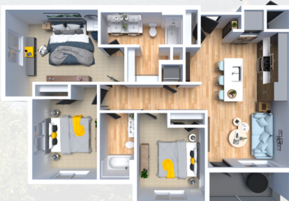
ODIN - 3 BED X 2 BATH: 1,254 SF

*All renderings & square footages are approximations. Floor plan sizes & finishes may vary.