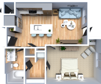
FREJA - 1 BED X 1 BATH: 718 SF