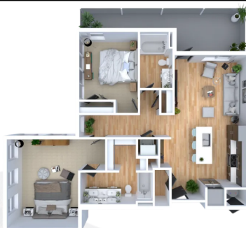
HYGGE- 2 BED X 2 BATH: 1,363 SF