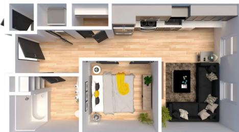
AXEL - STUDIO X 1 BATH: 550 SF