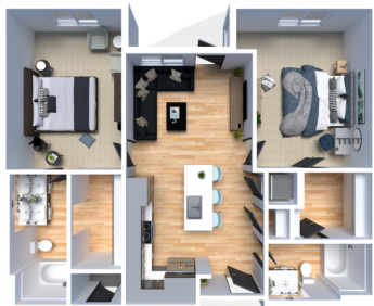
SELMA - 2 BED X 2 BATH: 1,099 SF