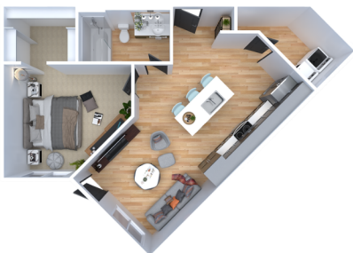
BERGEN - 1 BED X 1 BATH: 661 SF